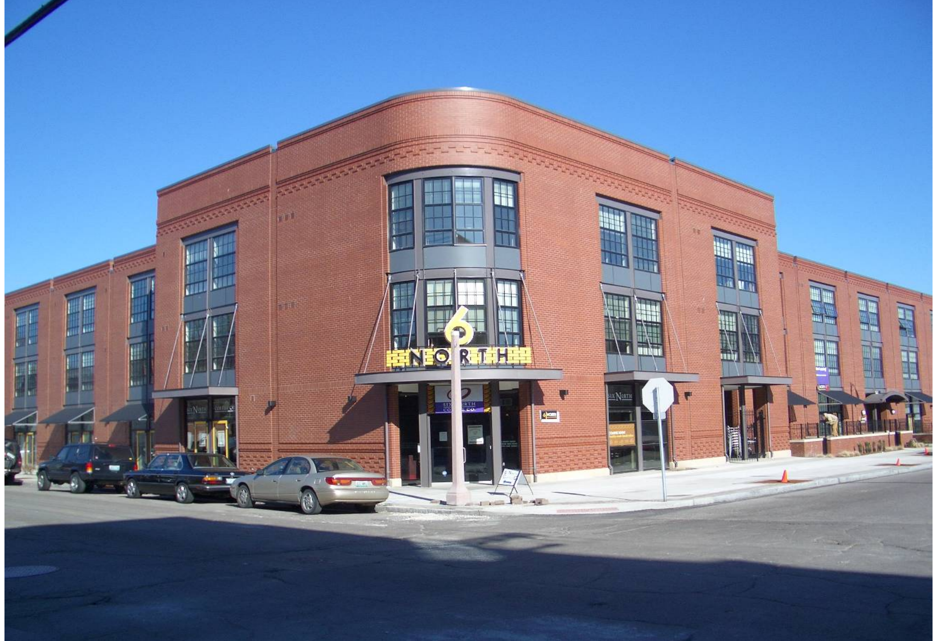
MCCORMACK BARON SALAZAR