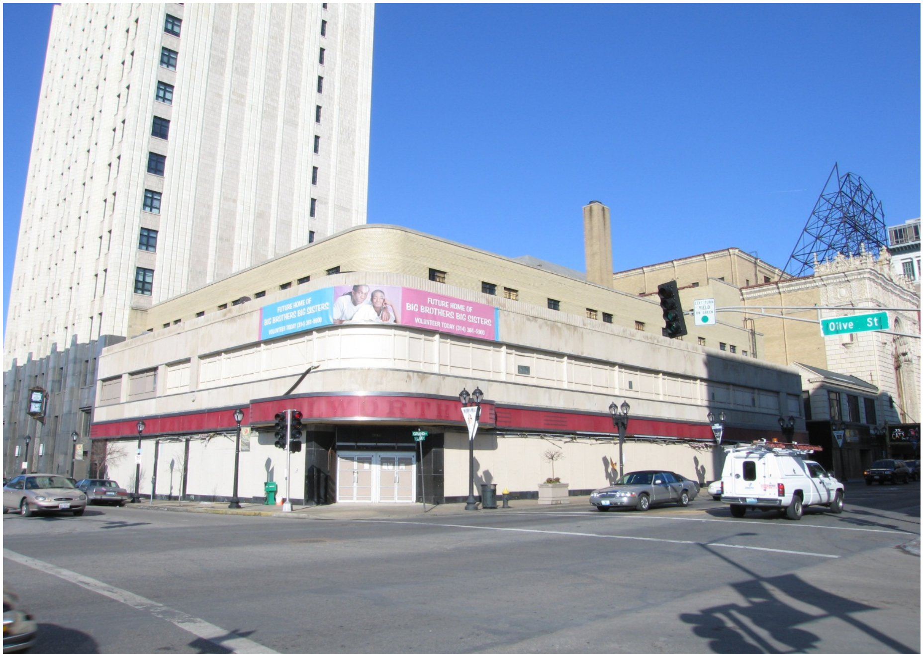
MCCORMACK BARON SALAZAR